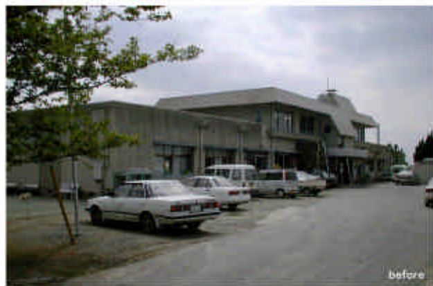
Yame city Multi generation center 2001/5 Yame-city Fukuoka-prefecture