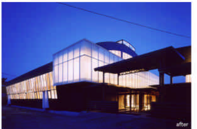
Sea Museum in Kamae 2005/3 Kamae-town Ohita-prefecture